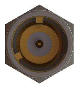
Keying 2 X 90°